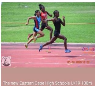
The new Eastern Cape High Schools U/19 100m

*ARRANGE FOR DEBIT ORDER FOR CONVENIENCE